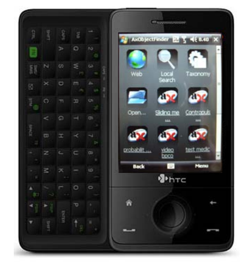
Figure 2 -- AxObjectFinder

The AxObjectFinder for PDA has been designed to enforce semantic processing and intelligence, and support the users to collect, index, organize, update, search and retrieve content on the basis of their metadata, IDs, semantic descriptors, user behavior (number of plays/executions, time of plays), user preferences for accessing, searching, playing, etc.