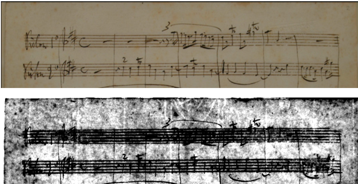
Figure 3: The top image shows a typical digitisation of a music manuscript, and the bottom image illustrates the hidden watermark design using back-lighting technique.

From the segmented pixels, various image processing techniques are used to analyse the pattern found. The foreground could be processed by an optical music recognition system, an optical character recognition system or other relevant processing. The background, which includes the decolourisation and other stains, could be preserved untouched. This project focuses on the automatic watermark tracing using edge detection and border tracing techniques, converting the segmented bitmap into a graphical description to be stored in a vector format, such as PostScript or SVG.