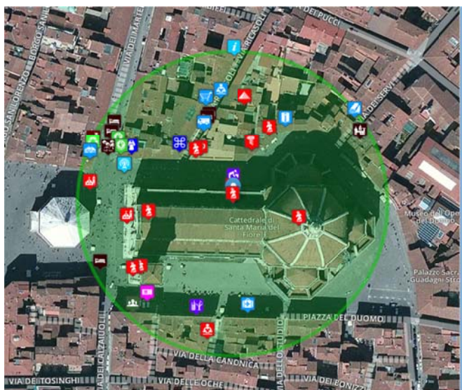
Figure 2: ServiceMap results performing the visual query on Km4City knowledge base.

time makes the implementation of web and mobile Apps more independent from the data of the smart city. For example, traditionally a certain API call adopted in mobile App can request a list of services' types in an area. If the developer decides to change the list of requested service type, the mobile App has to be rebuilt. On the contrary, adopting an API call based on QueryID, the developer can simply change the query associated with the QueryID without rebuilding the application. For example, to get the HTML, the URL represents the same query stored with a QueryID http://servicemap.disit.org/WebAppGrafo/api/v1/?queryId=9e5662a352d90ad4bc77690277a371ab&format=html (see Figure 2). In Sii-Mobility, the developers may use the ServiceMap tool to compose visually some geographical and textual queries, and from them to request the sending of an email containing the calls that can be performed for obtaining the same resulting data in JSON and/or web page in HTML. In Figure 2, the ServiceMap at work is presented.